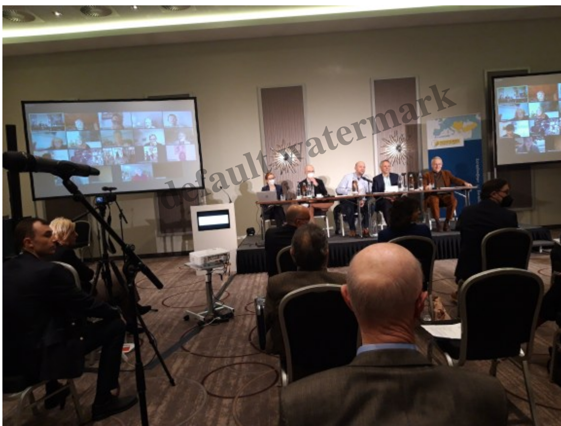
Picture: Advisory Board Meeting of SOG on 25th February 2022

I feel entitled and also urged to question that frame, as I cannot consider myself a ‚young‘ person: I am 42 years old. However, this allows me to look back to at least 22 years of a perspective on youth empowerment in Bosnia and Germany: Right after school, I went to Bosnia and worked for the German youth association Schüler Helfen Leben (SHL) and the Campaign for Conscientious Objection (Kampanja za Prigovor Savjesti). One of my first tasks, in the year 2000, was to co-organize a youth summit with a very prominent and important guest-speaker: Wolfgang Petritsch, then High Representative of the International Community. And guess what he said: nearly the same as present-day High Representative Christian Schmidt. He highlighted the role of the youth as the future leaders of the country. We all, including myself, were really charmed and happy about these words – because hey! – the future was our’s!